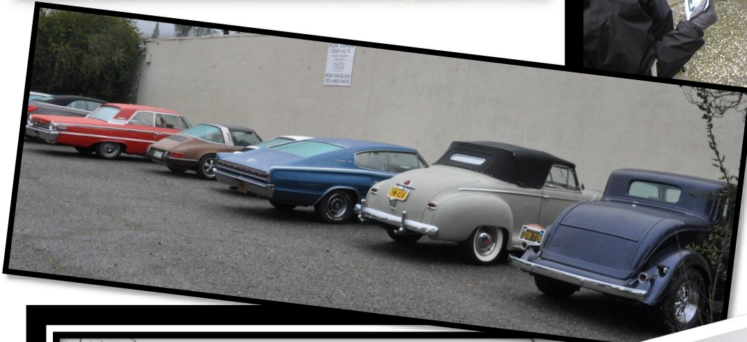
Pit stop at Plank Coffee in Cloverdale