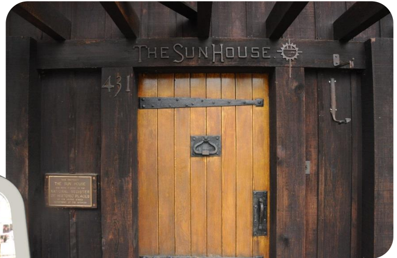
Last Stop: Grace Hudson Museum in Ukiah