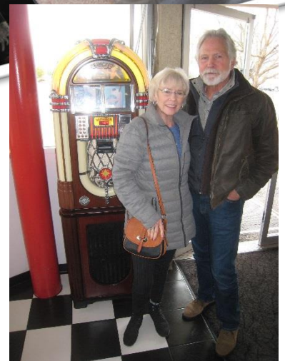
Be-Bop Diner in Ukiah