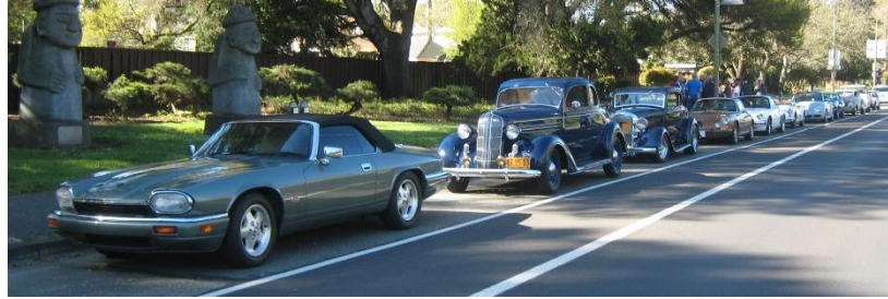
Chartered June 1976