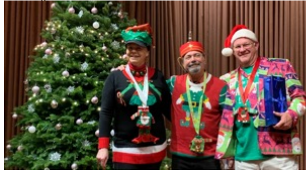
Chartered June 1976